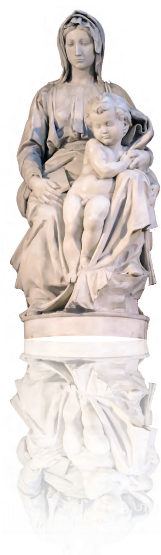
Madonna of Bruges, by Michelangelo