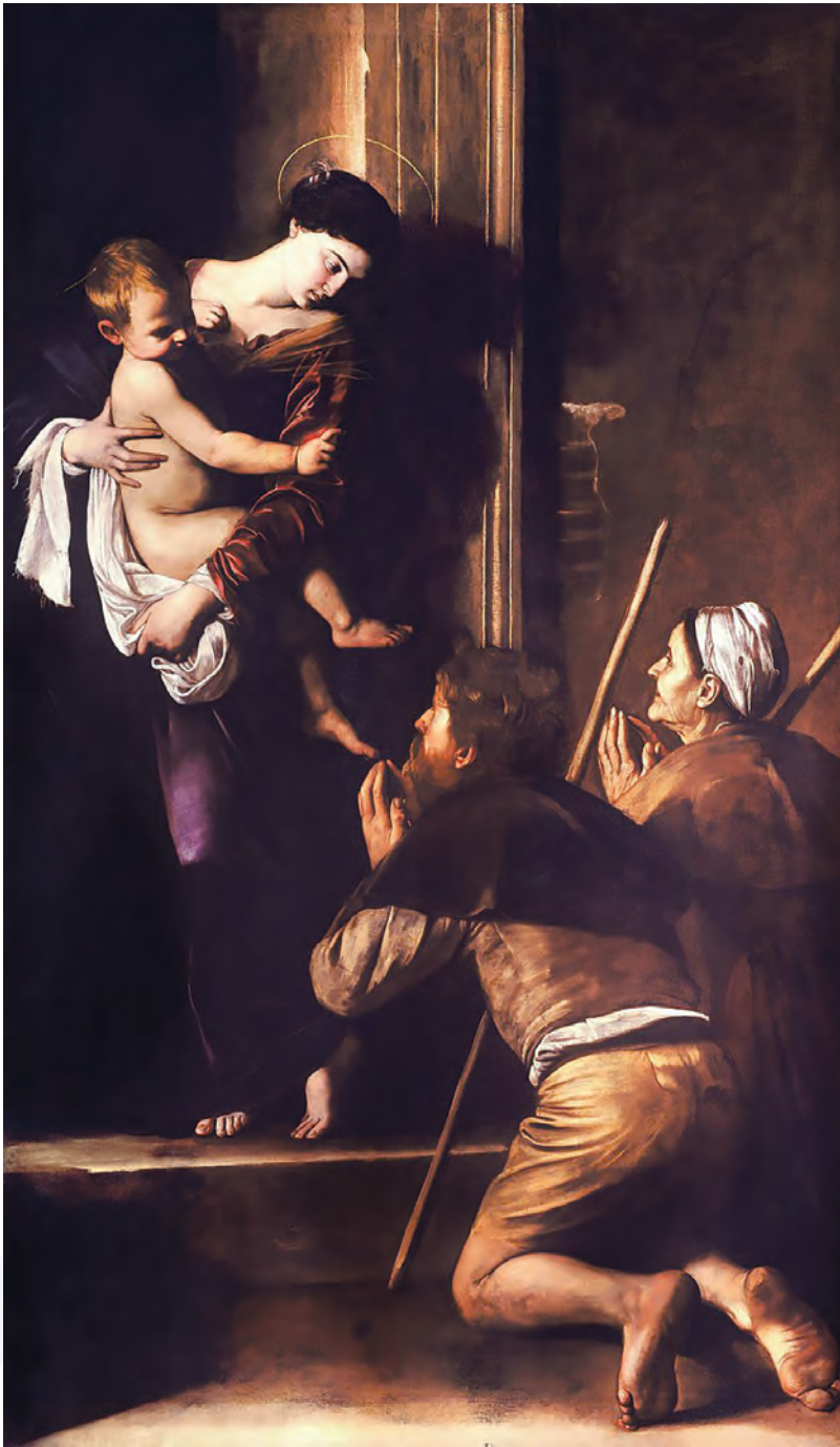
Madonna di Loreto - Amerighi da Caravaggio (c.1604-6)